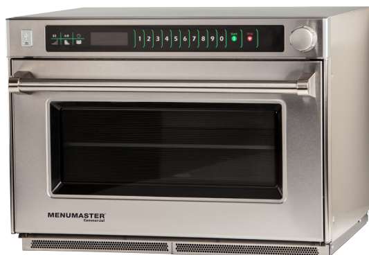
Model MSO22 shown